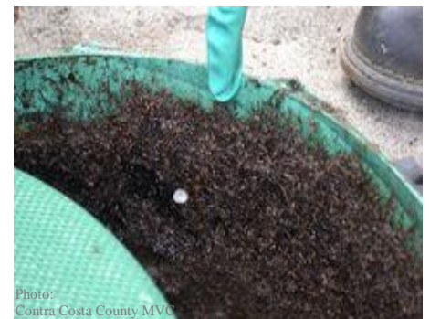
Thousands of adult mosquitoes under tank lid.

Santa Cruz County Mosquito & Vector Control Pesthelp@santacruzcounty.us (831) 454-2590