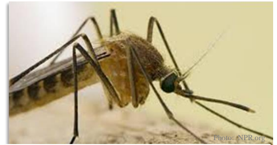
The Northern House Mosquito, Culex pipiens

It enters the home and bites at night ; with a tell-tale buzz that you may hear as you try to go to sleep. Septic systems may allow these mosquitoes access through small gaps in above ground lids, un-capped cleanouts or un-screened vents. A 2mm gap is all that is needed for a septic tank to become infested. Mosquitoes from one septic tank may affect an entire neighborhood.