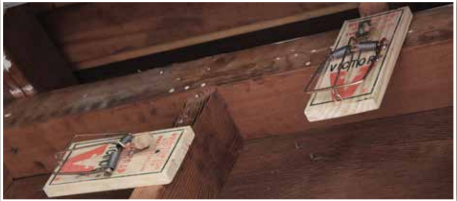
Proper trap placement on beams and rafters. Note rub marks on beams indicating rat trails.

Tie or wire down the traps wherever possible. Traps can be re-used. The working parts of the trap should be oiled occasionally using mineral oil - never petroleum based oils. These oils may act as a repellent to rodents. Never store traps near insecticides or other chemicals, or handle domestic animals or pets before setting out traps. This also can cause traps to take on a repellent odor.