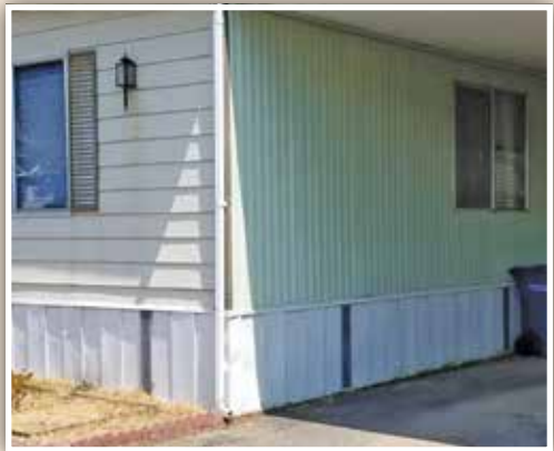
This type of panel skirting around a mobile home unit can become compromised. Fix/patch using methods described in this pamphlet anytime there is damage.