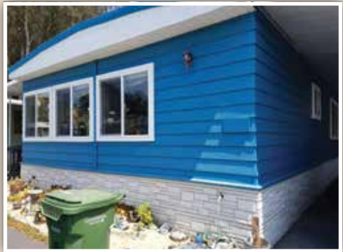
These types of sidings are less conducive to rodent problems, but all vents should still be checked and maintained to prevent rodent entry.

The second line of defense is to make sure the polyethylene under-belly wrap has no holes in it, and all gaps around pipes are fixed. Duct tape is used to fix these areas and cleaning the surface before taping will ensure that the tape sticks well.