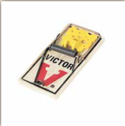
Mouse-sized snap trap.

If trapping around children or animals, traps should be placed in a secure box or covered to prevent accidents. Placement of snap traps is crucial to their effectiveness. Place traps in areas frequented by rats. Rats establish runways along fence tops and next to walls. Look for the presence of rat droppings when placing snap traps. Place the end of trap containing the trigger against a wall or known runway. Snap traps can also be attached to pipes or studs with wire, nail, or screws.