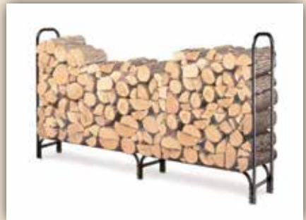
Firewood stands are practical and easy to use.