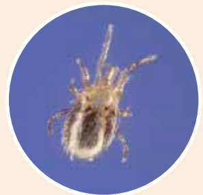
Tropical Rat Mite ( Omithonyssus bacoti )*****

Our services also include mite identification. You can provide samples for our laboratory by dabbing clear tape around the walls, baseboards, and electrical sockets. Our staff can provide more instruction on mite control depending on your situation.