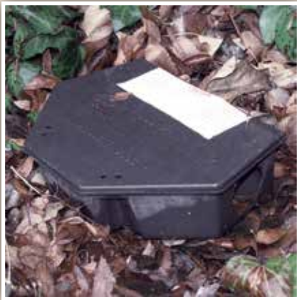
Closed tamper-proof bait station.

Do not bait until all rodent entry points are fixed within the home, as rodents will die in walls, under home, or in attic. Always follow label precautions and recommendations.