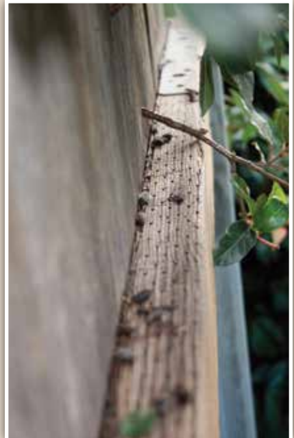
Droppings on fenceline.