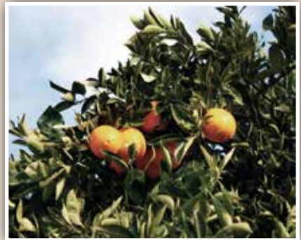
Watch for signs of rats such as hollowed-out oranges either on the ground or still attached to the tree.