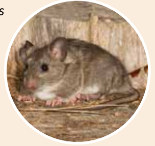
Dusky-Footed Woodrat ( Neotoma fuscipes )*****