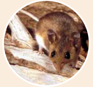
Deer Mouse ( Peromyscus maniculatus )****