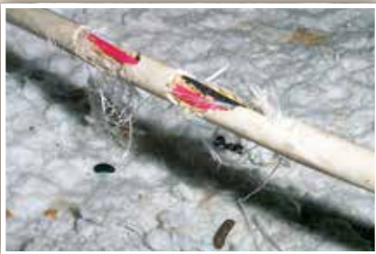
Gnawing on wires can result in fires.*