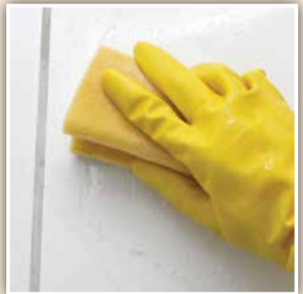
Always wear protective gloves when handling or cleaning rodent evidence.

Once the newly cleaned area is dry (in approximately 30 minutes) it's ready for reuse.