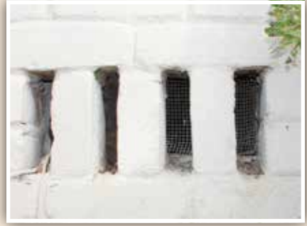
Check for loose mesh in foundation vents.