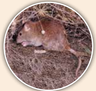
Norway Rat ( Rattus norvegicus )**