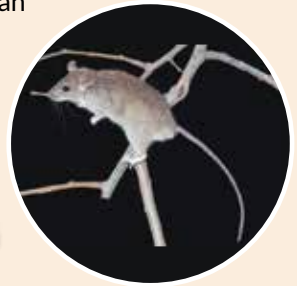
Roof Rat ( Rattus rattus )**