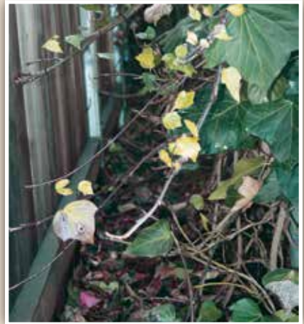
Ideal rat nesting area: dark space between fences covered with ivy.