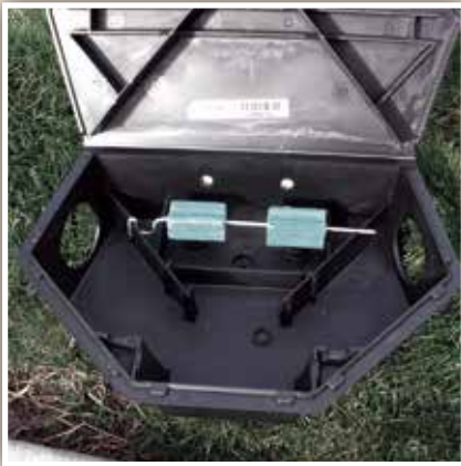
Open bait station with bait blocks.

All rodenticides must be checked often and replenished immediately when the supply is low. When the job is finished, uneaten rodenticides should be removed and disposed of according to the label.