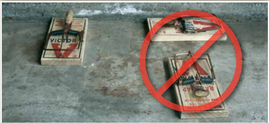
Properly placed traps at floor level.