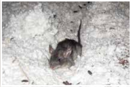
Rats often use the same trails repeatedly.*