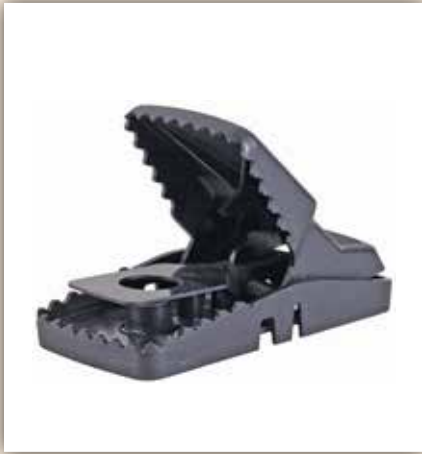
Rat-sized snap trap.

Bait selection is important for trapping success. Peanut butter, nutmeats, bacon, pieces of apple, candy and moistened oatmeal are effective baits. For best results, try several different baits to see which is most acceptable by rodents.