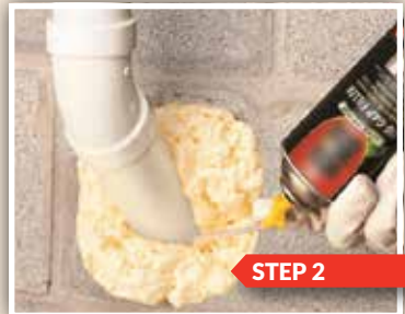
Step 2: Spray foam into steel wool.