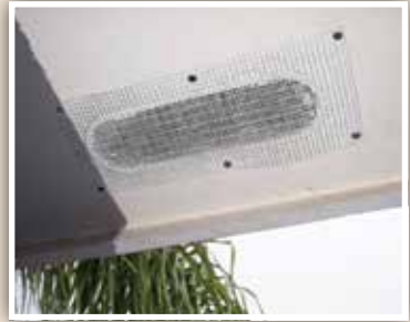
Soffit vent hole sealed with screen.*

MAKE SURE YOU TRAP BEFORE AND AFTER SEALING GAPS TO PREVENT SEALING RODENTS IN WALLS