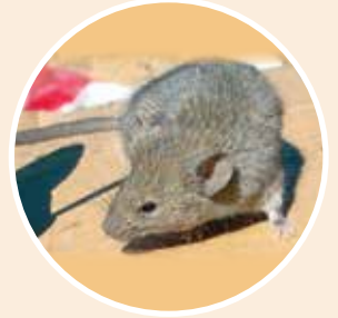
House Mouse ( Mus musculus )***