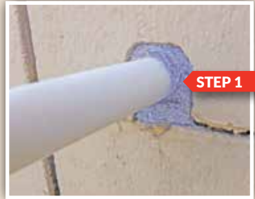
Step 1: Fill gap with coarse steel wool.