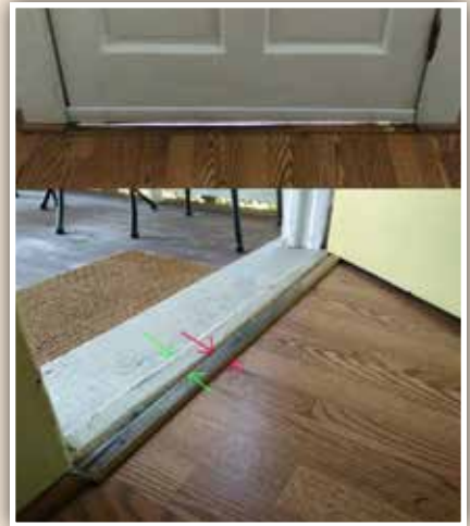
Open space at threshold of doors.