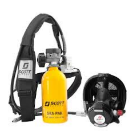
Supplied Air Respirator (SAR)