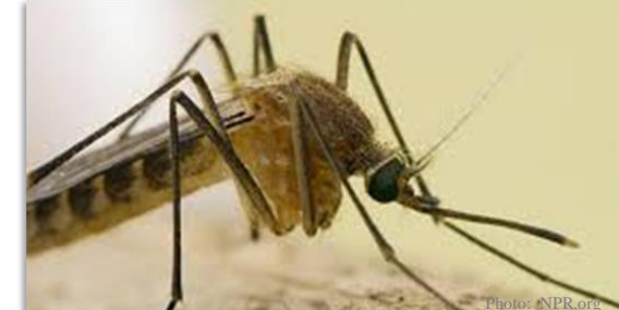
The Northern House Mosquito, Culex pipiens

It enters the home and bites at night ; with a tell—tale buzz that you may hear as you try to go to sleep. Septic systems may allow these mosquitoes access through small gaps in above ground lids, un-capped cleanouts or unscreened vents. A 2mm gap is all that is needed for a septic tank to become infested. Mosquitoes from one septic tank may affect an entire neighborhood.