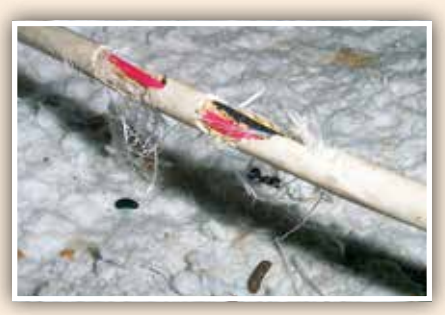
Gnawing on wires can result in fires.*