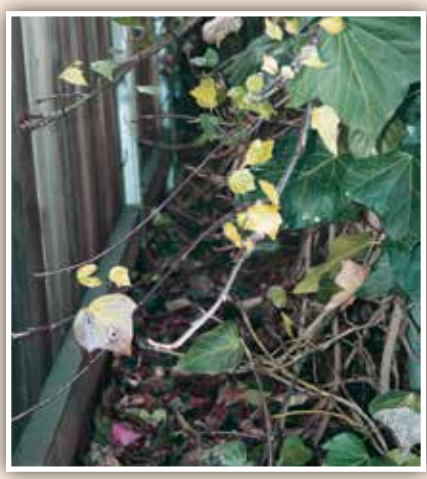
Ideal rat nesting area: dark space between fences covered with ivv.