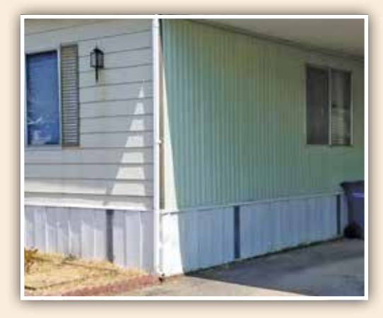
This type of panel skirting around a mobile home unit can become compromised. Fix/patch using methods described in this pamphlet anytime there is damage.