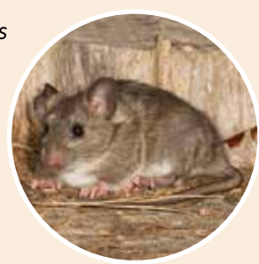
Dusky-Footed Woodrat (Neotoma fuscipes)*****