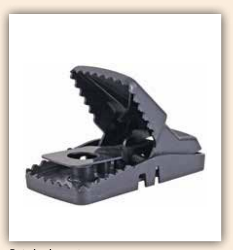
Rat-sized snap trap.

Bait selection is important for trapping success. Peanut butter, nutmeats, bacon, pieces of apple, candy and moistened oatmeal are effective baits. For best results, try several different baits to see which is most acceptable by rodents.