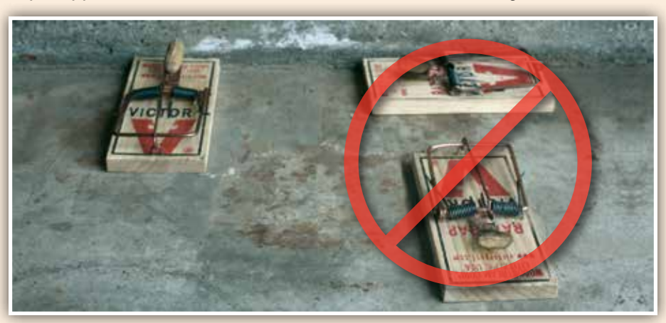
Properly placed traps at floor level.