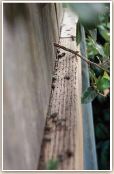
Droppings on fenceline.