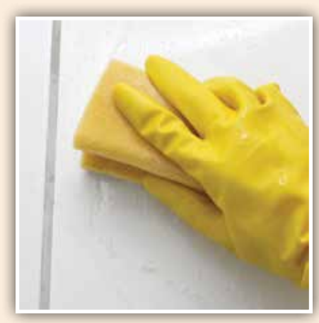
Always wear protective gloves when handling or cleaning rodent evidence.

Once the newly cleaned area is dry (in approximately 30 minutes) it's ready for reuse.