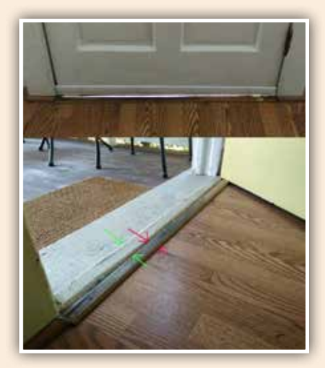
Open space at threshold of doors.