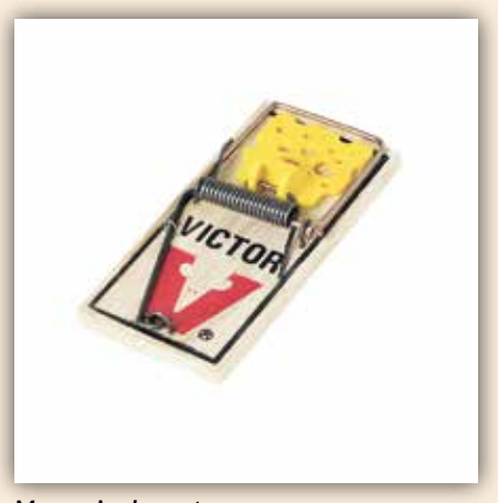
Mouse-sized snap trap.

If trapping around children or animals, traps should be placed in a secure box or covered to prevent accidents. Placement of snaps traps is crucial to their effectiveness. Place traps in areas frequented by rats. Rats establish runways along fence tops and next to walls. Look for the presence of rat droppings when placing snap traps. Place the end of trap containing the trigger against a wall or known runway. Snap traps can also be attached to pipes or studs with wire, nail, or screws.