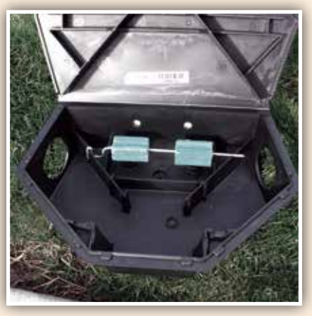
Open bait station with bait blocks.

All rodenticides must be checked often and replenished immediately when the supply is low. When the job is finished, uneaten rodenticides should be removed and disposed of according to the label.