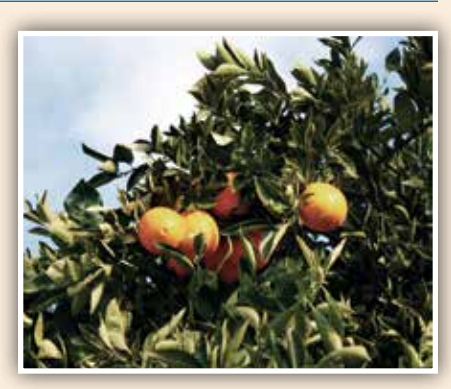
Watch for signs of rats such as hollowed- out oranges either on the ground or still attached to the tree.