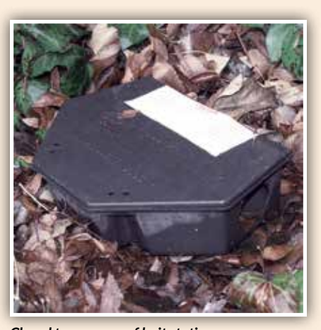
Closed tamper-proof bait station.

Do not bait until all rodent entry points are fixed within the home, as rodents will die in walls, under home, or in attic. Always follow label precautions and recommendations.