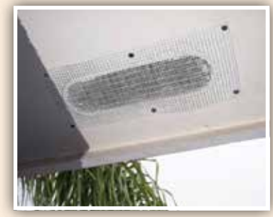
Soffit vent hole sealed with screen.*

MAKE SURE YOU TRAP BEFORE AND AFTER SEALING GAPS TO PREVENT SEALING RODENTS IN WALLS