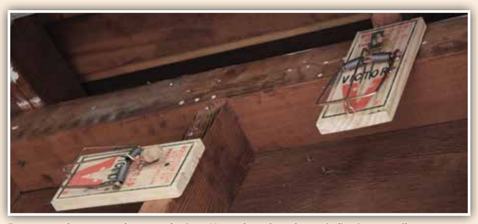
Proper trap placement on beams and rafters. Note rub marks on beams indicating rat trails.

Tie or wire down the traps wherever possible. Traps can be re-used. The working parts of the trap should be oiled occasionally using mineral oil - never petroleum based oils. These oils may act as a repellent to rodents. Never store traps near insecticides or other chemicals, or handle domestic animals or pets before setting out traps. This also can cause traps to take on a repellent odor.