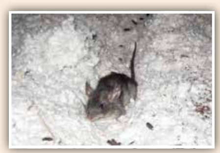
Rats often use the same trails repeatedly.*