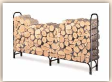
Firewood stands are practical and easy to use.