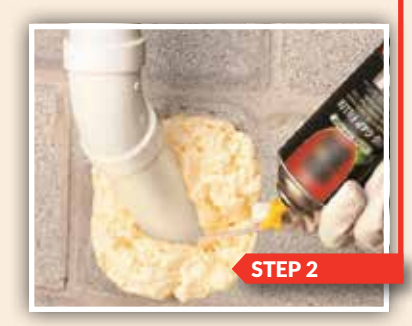
Step 2: Spray foam into steel wool.