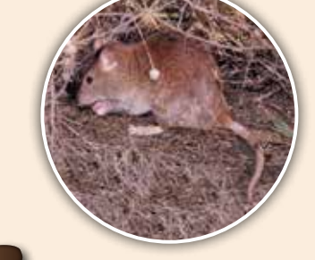
Norway Rat (Rattus novegicus)**