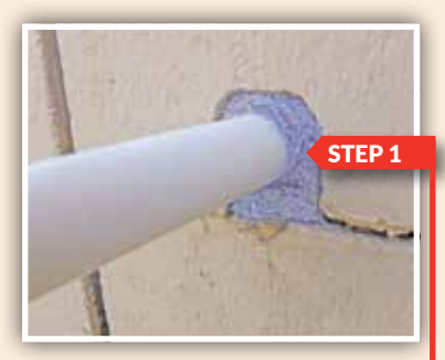
Step 1: Fill gap with coarse steel wool.