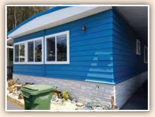
These types of sidings are less conducive to rodent problems, but all vents should still be checked and maintained to prevent rodent entry.

The second line of defense is to make sure the polyethylene under-belly wrap has no holes in it, and all gaps around pipes are fixed. Duct tape is used to fix these areas and cleaning the surface before taping will ensure that the tape sticks well.